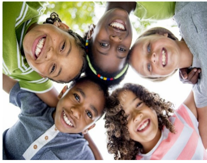
This Photo by Unknown Author is licensed